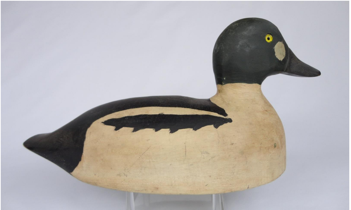
Drake goldeneye