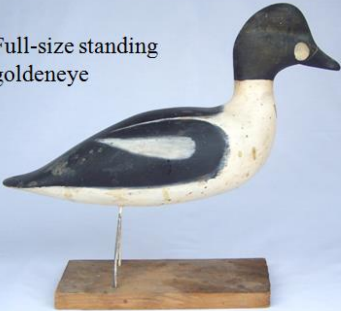
Full-size standing goldeneye