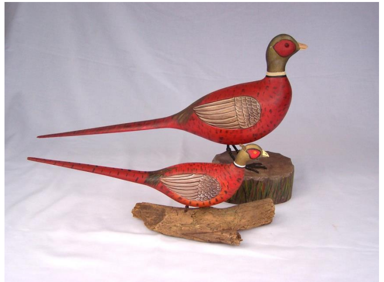
Clair Snyder carvings and paintings.