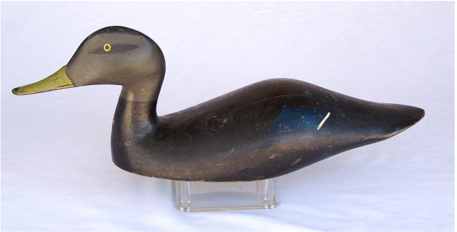
One of four known black ducks by “Dodie” Jones.