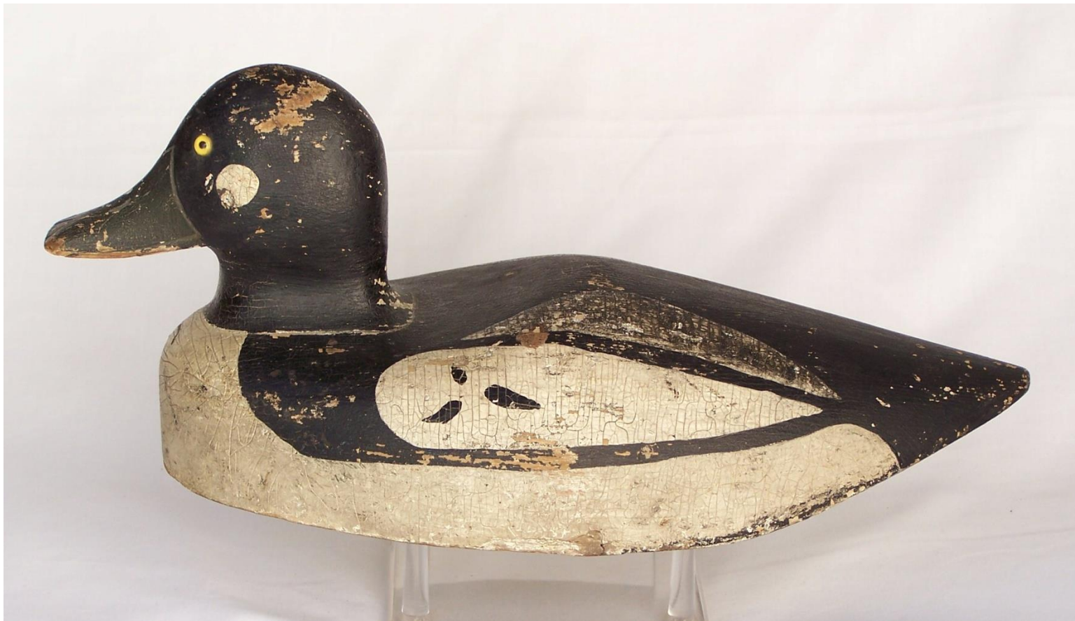
Drake goldeneye