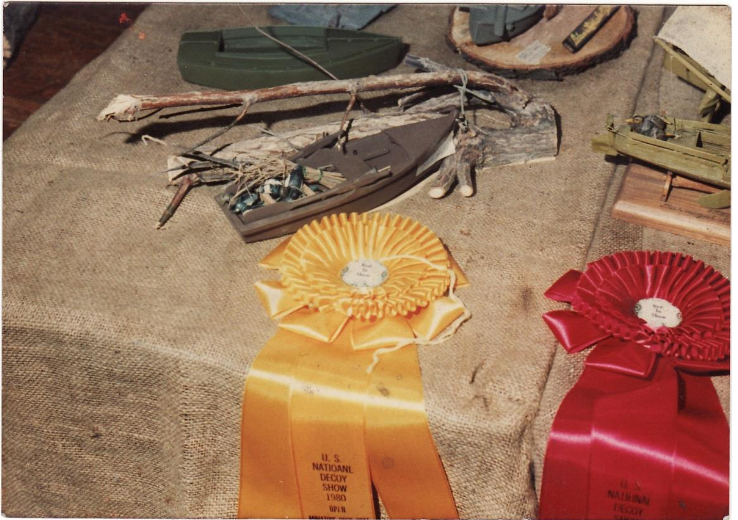
3 rd place miniature duck boat at the 1980 U.S. National Decoy Show