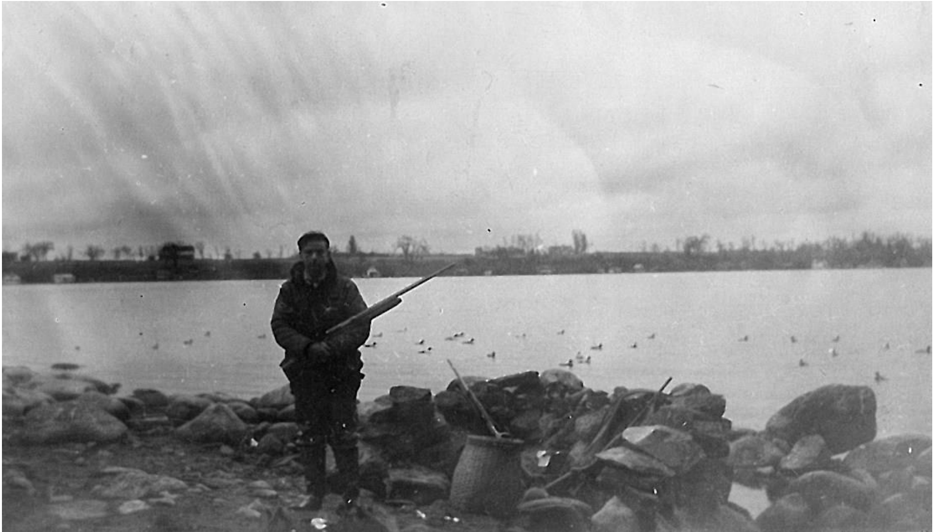
Hunting at Drummond's Island, c. 1943